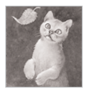
CHAPTER 4 ♣

Soft paws padded through Fireheart's dreams that night. A tortoiseshell she-cat emerged from the forest beside him, her amber eyes glowing. Fireheart gazed at Spottedleaf and felt the familiar ache in his heart. The pain of the medicine cat's death, so many moons ago, was as raw as ever. He waited eagerly for her gentle greeting, but this time Spottedleaf didn't press her nose to his cheek as she usually did. Instead she turned from him and walked away. Surprised Fireheart began to follow, breaking into a run to chase the dappled cat through the woods. He called out to her, but even though her pace hadn't seemed to quicken, she stayed ahead of him, deaf to his cries.