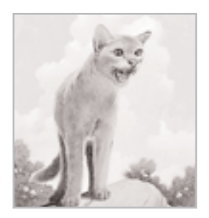
CHAPTER 26 ♣

Fireheart felt as if he had slept for only a moment when he woke. A cool breeze was ruffling his fur. The rain had stopped. Above, the sky was filled with billowing white clouds. For a moment he felt confused by the unfamiliar surroundings. Then he became aware of the sound of voices meowing nearby and recognized Smallear's trembling mew.