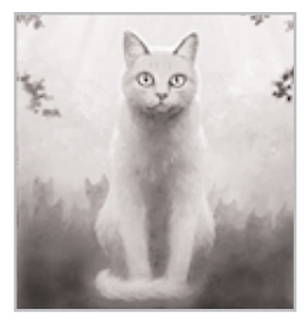
CHAPTER 1 ♣

Warm shafts of sun shine streamed through the canopy of leaves and flickered over Fireheart's pelt. He crouched lower, aware that his coat would be glowing amber among the lush green undergrowth.